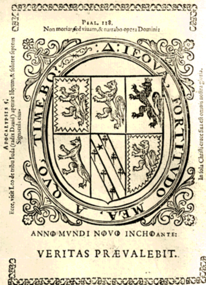
ARMS OF DEE AS SHOWN IN A CUT AT THE END OF HIS "LETTER APOLOGETICALL." (1599).